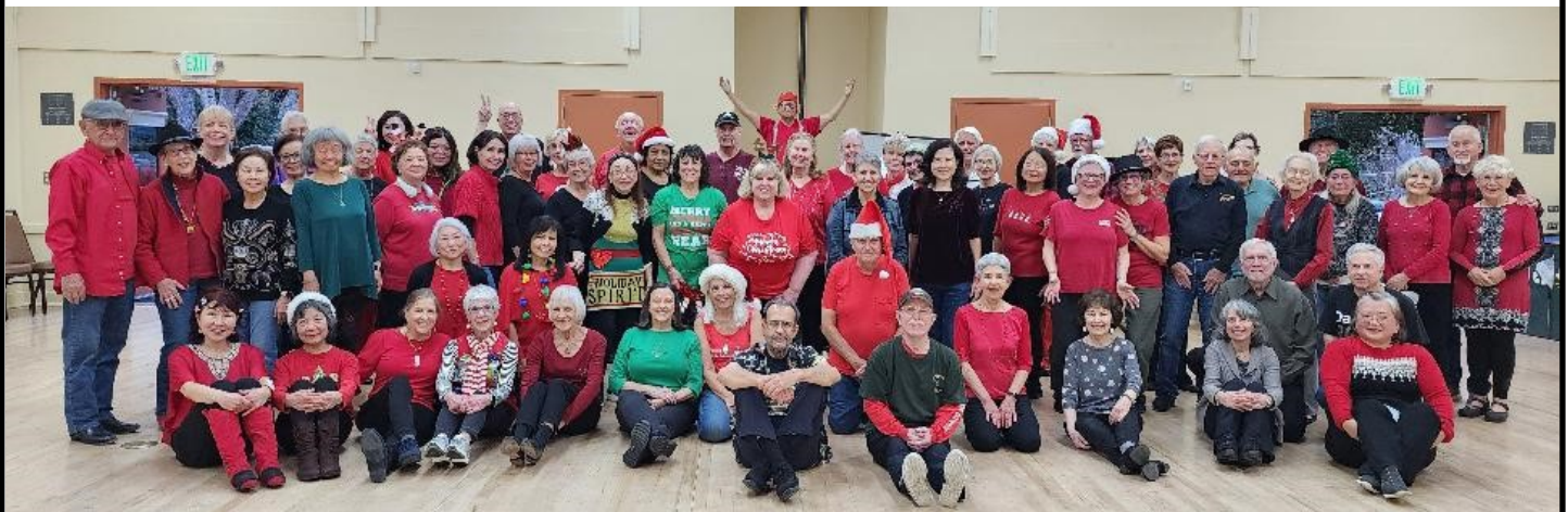
Dec 21st Christmas Party