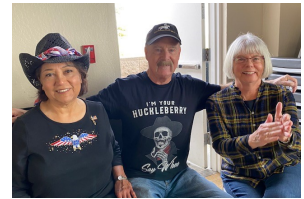
Dec 7th Cowboys Don't Cry