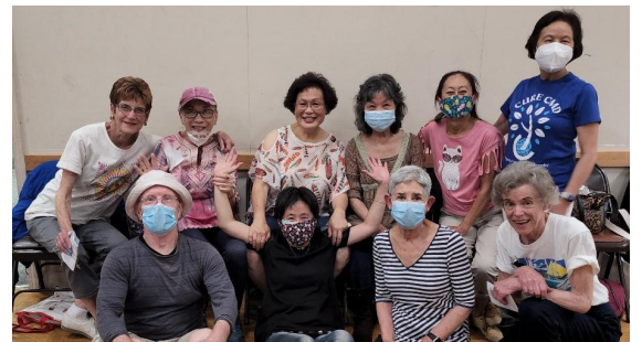
July 16th "Shipwrecked"