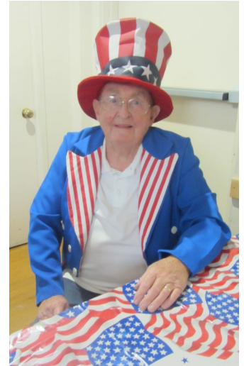
July 2nd Yankee Doodle Dandy