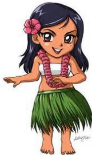
August 3 Hawaiian Luau