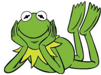
August 31 Kermit & Miss Piggy