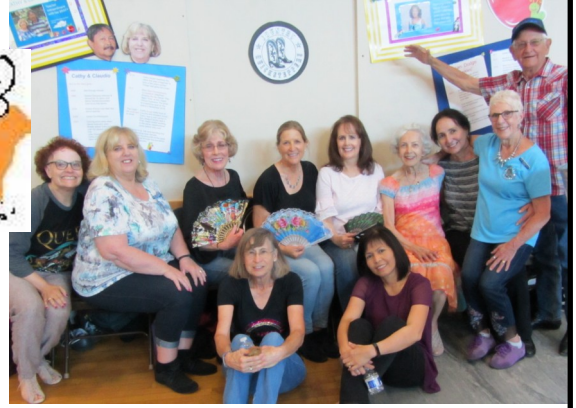
JULY 20 DJ & TEACHER APPRECIATION NIGHT