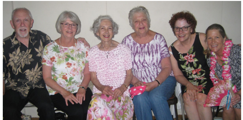
August 4th Lovely Hula Hands