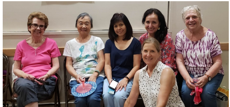
August 18 "Hot August Nights"