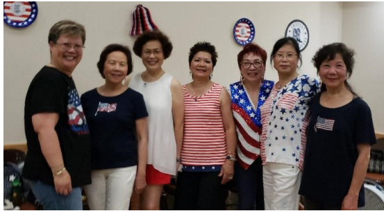
June 30th Red, White & Blue