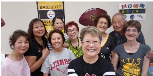
JULY 7th Sports Night