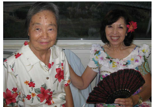
AUGUST 1st Hawaiian Luau