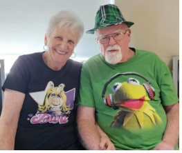
October 7 "Kermit & Miss Piggy"