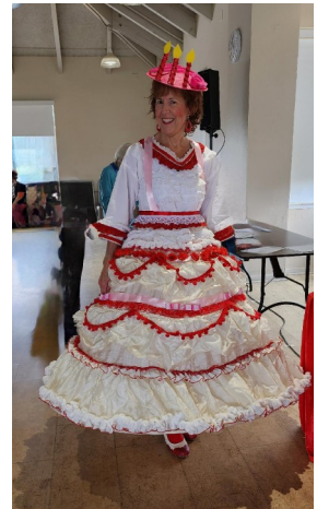
September 16 Birthday Bash!