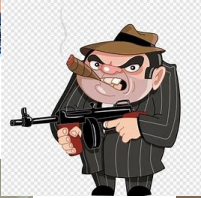
September 7 "Gangsters"