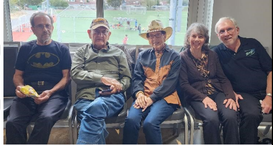
October 21 "Clowning Around"