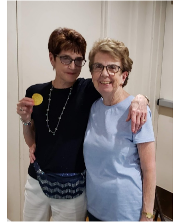
September 21 "Blue Moon"