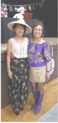
Sept 1st International Night