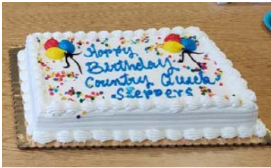
Sept 15th Birthday Bash