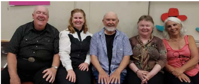
Sept 29 Cowboys Don't Cry