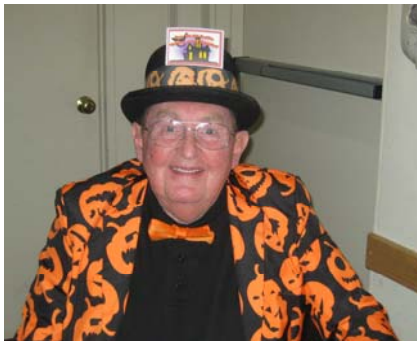
Oct 20 Clowning Around