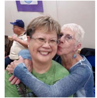
Oct 6th "Blue Moon"