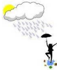
Oct 7th Dancing In The Rain