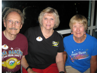
Sept 2nd Club T-shirt night