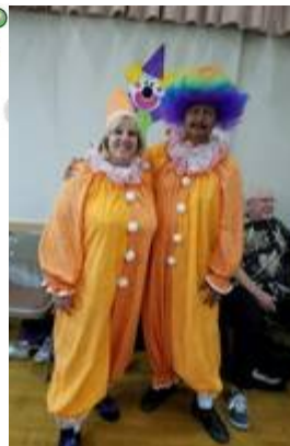
October 21st "Send In The Clowns"