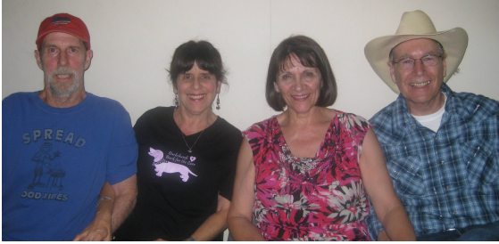
Sept 30th Question & Answer