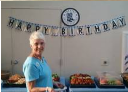
Sept 16th Quickstepper's 30th Birthday Bash!