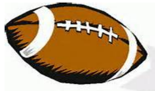
OCTOBER 1st SPORTS NIGHT