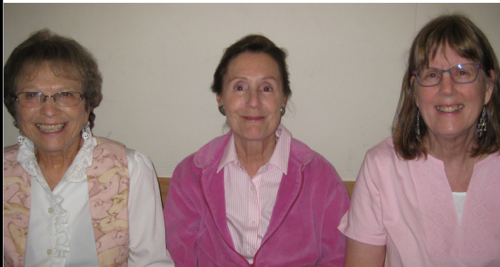
OCTOBER 15th PINK & BLUE