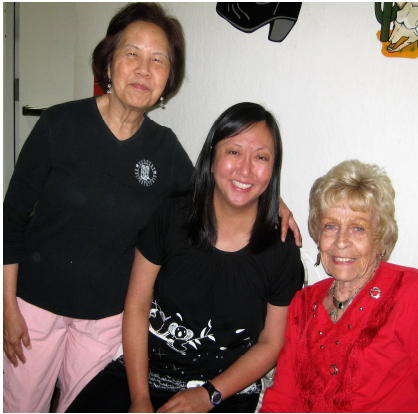
SEPT 5 COW- GIRLS RULE