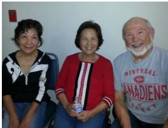
OCT 17 ITALIAN AMERICAN NIGHT