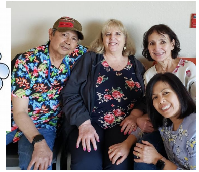
APRIL 1st SPRING HAS SPRUNG