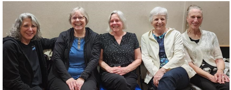
APRIL 15th APRIL SHOWERS