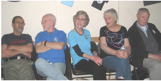
April 6 Club T-shirt Night