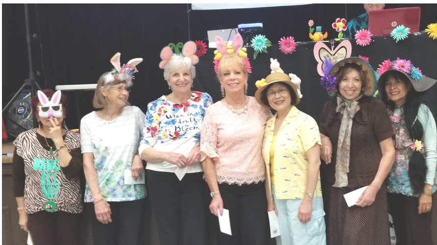
April 20 Easter Bonnet