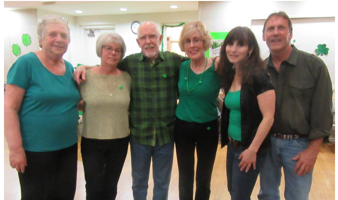
MARCH 18 St. Patrick's Day Hangover !!