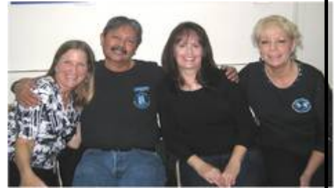
MARCH 4th CLUB T-SHIRT NIGHT