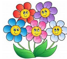
APRIL 1st WALTZ OF THE FLOWERS