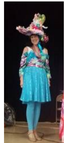
APRIL 15th EASTER BONNET