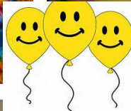
April 16 Smiley Face!