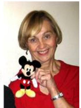
March 5 DISNEY!!