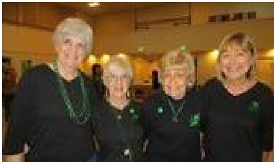
March 19 St Pat's Hangover