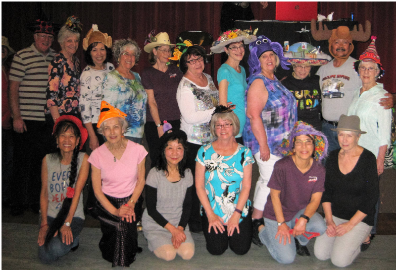
April 2nd Funny Hats!