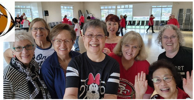
February 2nd Sports Night