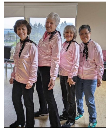
January 6th P is for Pink