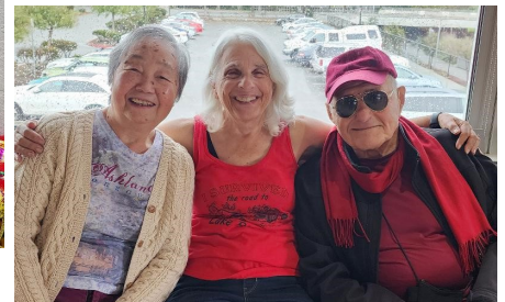
February 17th Chinese New Year