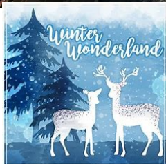
January 20th Winter Wonderland