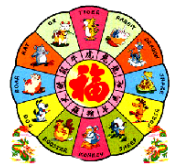
January 21st Chinese New Year