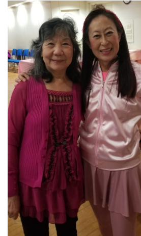
January 7th P Is For Pink