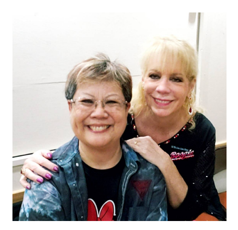
FEB 2nd GIRLS RULE!