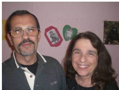
Jan 30 was our “Beautiful Baby dance”-dancers brought pictures of themselves as babies.