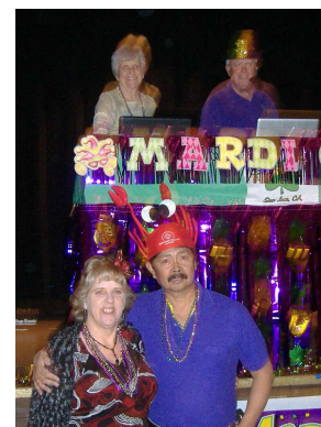
Feb 20-Mardi Gras dance!