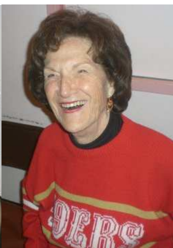
Feb 6 was our “Super Bowl” dance-here some of our members show their support for the local team.