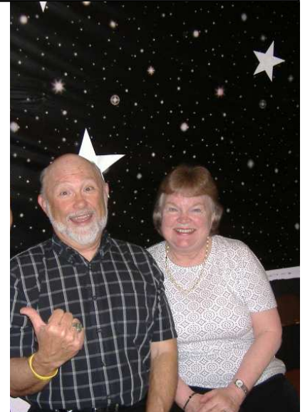
Our Black & White Ball was on May 2nd