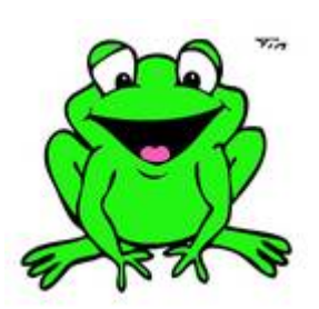
MAY 19 It's Not Easy Being Green!