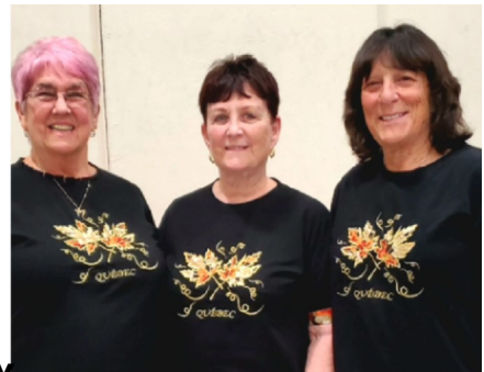
NOVEMBER 19 Turkey Lurkey