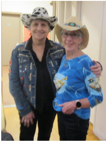
NOVEMBER 5 Cowboy's Don't Cry