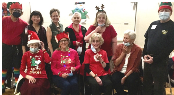
December 18 Santa's Elves