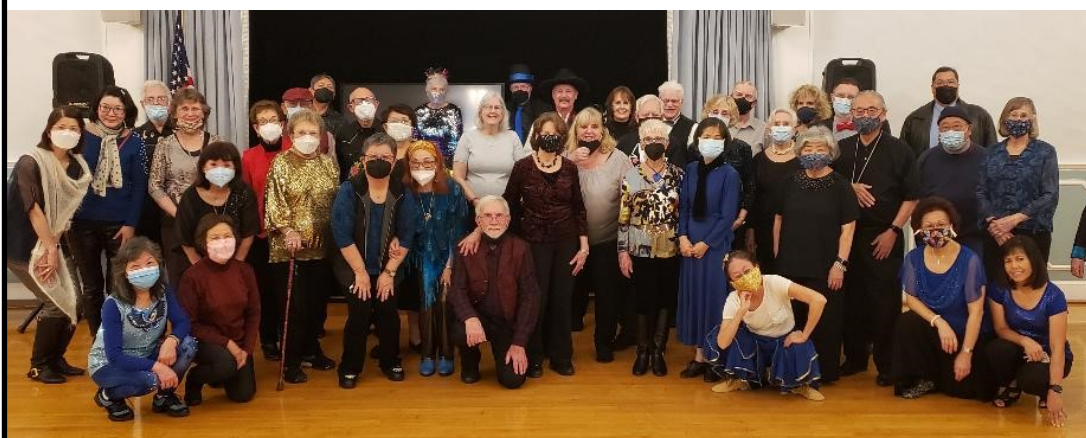
DECEMBER 31-NEW YEAR'S EVE