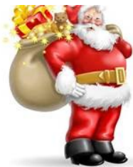
December 21 Ho Ho Ho