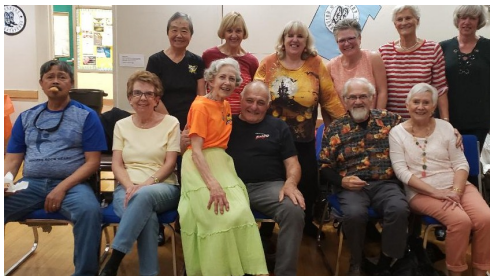
November 16 Pumpkin Patch