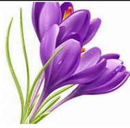
December 7 Purple Passion