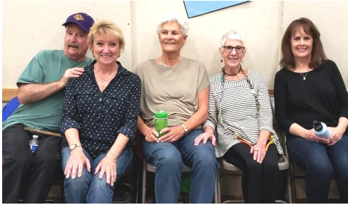
November 2 Tick Tock