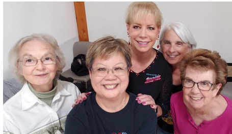
November 30 Cowboys Don't Cry