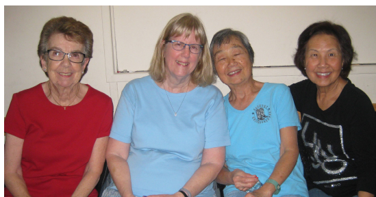
Nov 3 Tick Tock