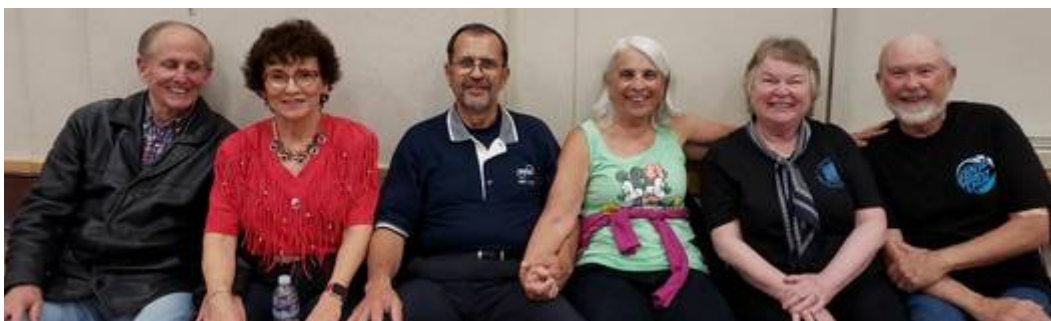
Dec 1st Moonshine Madness