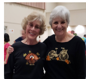
Nov 17 "Turkey Lurkey"