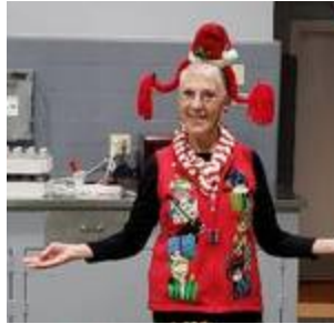
Dec 15 Christmas Dance