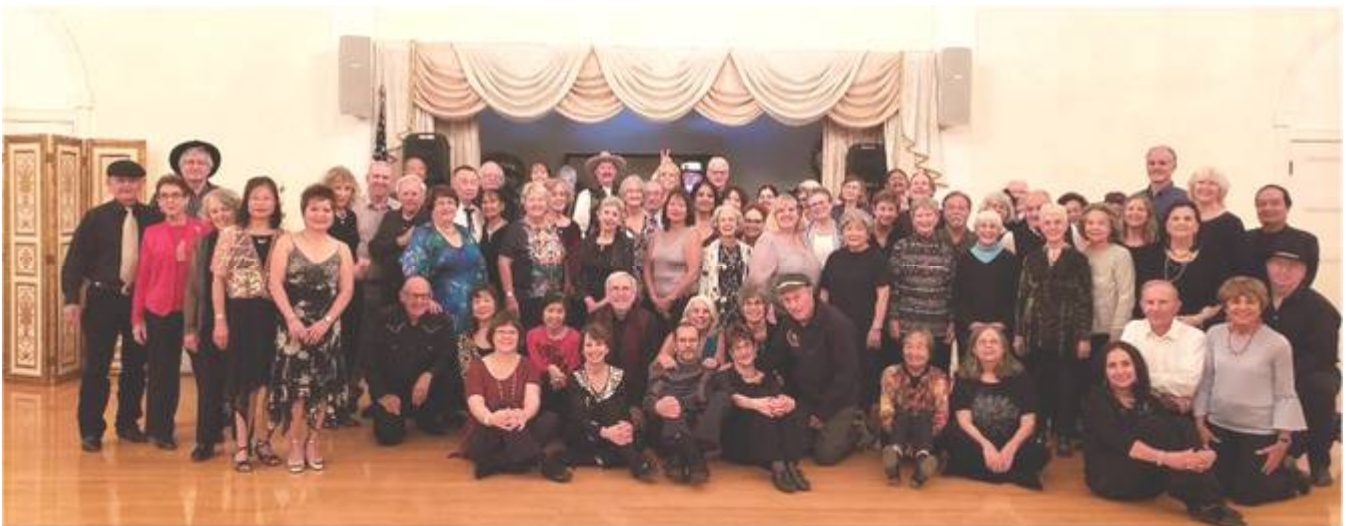
NEW YEAR'S EVE "GOLD STAR GLITZ AT THE RITZ"