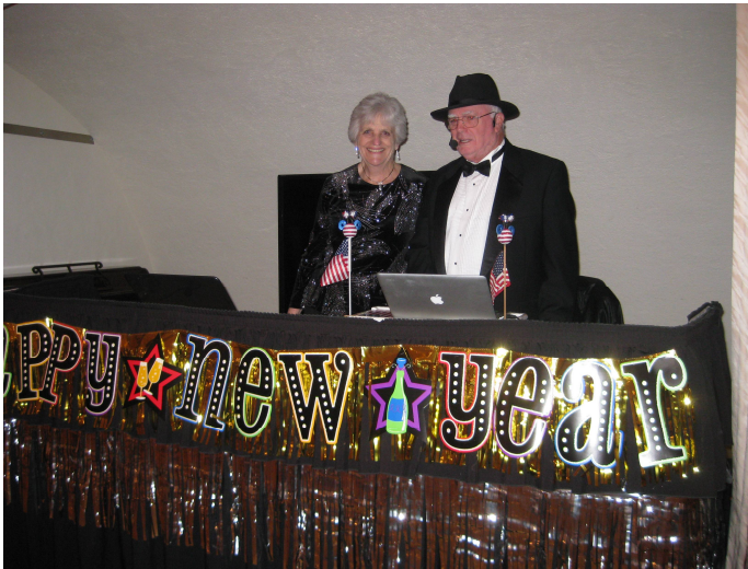
DECEMBER 31st "GLITZ AT THE RITZ!!"