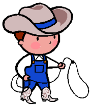
December 5 Cowboys Don't Cry