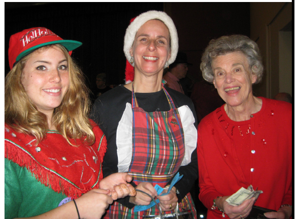
December 19 Christmas Dance