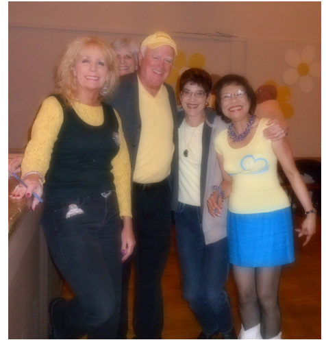
November 16 "Mellow Yellow"