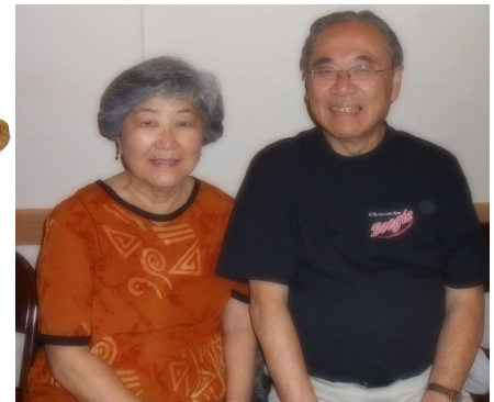
November 30 "Favorite Hat"