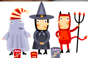
Our Halloween dance was held at The Complex on October 29th