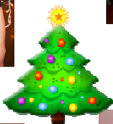
December 17th was our Christmas dance