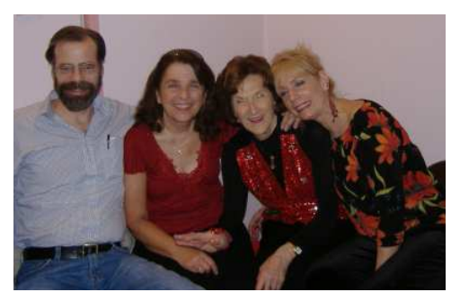
Dec 19th was our Christmas