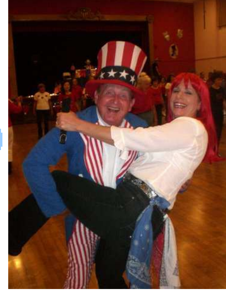
JULY 3rd—RED, WHITE & BLUE Dance